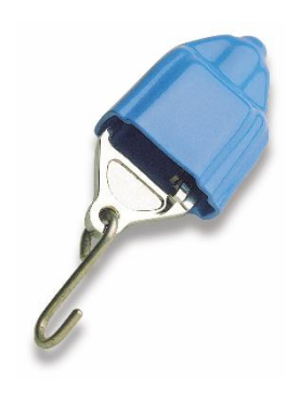
Special Tensor for Cable Floating Lanes